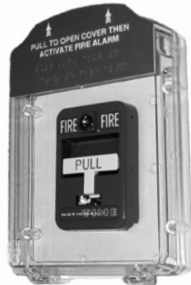
Semi-Flush Mount Installation Pull Station not included

NATIONAL TIME's Station Cover is a rugged polycarbonate cover used to help protect manual pull stations and other devices from false alarms, vandalism, dust and weather. It is available in a variety of configurations to satisfy most applications.