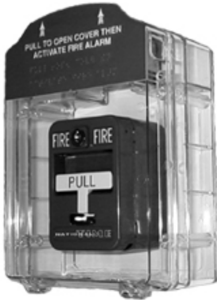
Surface Mount Installation Shown with optional Extender Kit Pull Station w/ Backbox not included