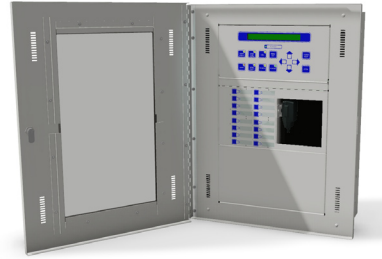
Shown in A901-BOX-SINGLE-F-W

Box and Door Ordered Separately. See Bulletin F-555: 901 Cabinets