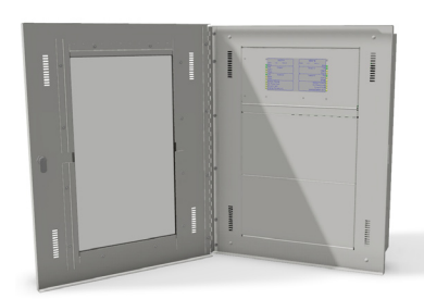
Shown in A901-BOX-SINGLE-F-W

Box and Door Ordered Separately. See Bulletin F-555: 901 Cabinets