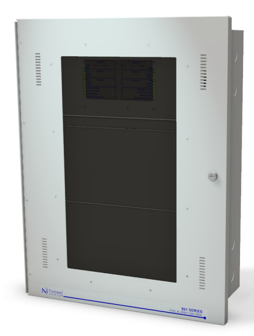
A901-NACP-2-CHASSIS in A901-BOX-SINGLE-F-W shown

The 901 Series NACP shares the 901 FACP innovative chassis/box design concept that eases installation effort and provides clear access to all field connections. It shares the multiple box and trim combinations of the 901 FACP Series to create an attractive and versatile installation.